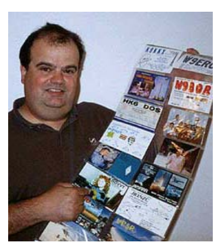
Me and my QSL collection, one of my "visual aids" for my classroom presentation.

I started by telling them that I was here to talk about Amateur Radio. I asked if they had ever heard of Amateur Radio. Two kids raised their hands, but none actually knew a ham.